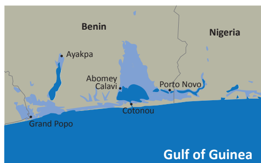
Figure 2. Examples of heavily populated areas threatened with a 3-meter rise in sea levels